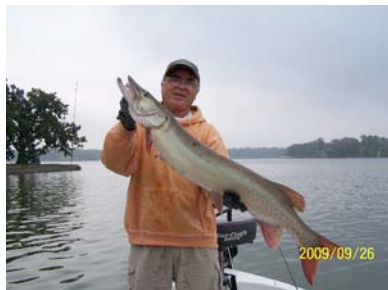
Gino Testone Fox Chain 45" Musky